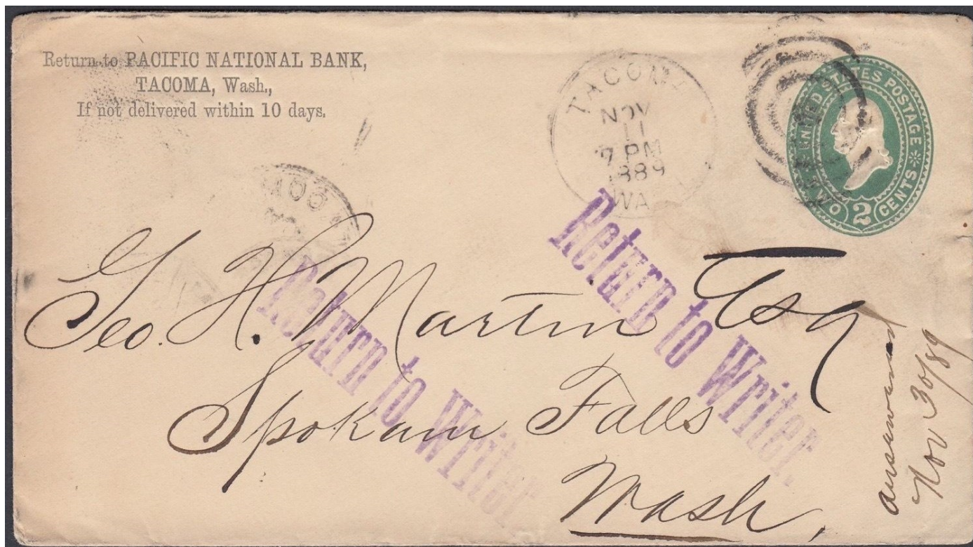
Figure 1: Tacoma, November 11, 1889 to Spokane Falls, Washington with “Return to Writer” hand stamps

This cover shows why it is important to carefully examine postal history covers, and how a bit of knowledge can lead to surprising discoveries. I recently purchased this cover on eBay. I don’t collect Tacoma, and am more interested in Spokane and Eastern Washington. I liked that it was sent to Spokane Falls—the name of the city until changed to Spokane on April 24, 1891, and I liked the purple “Return to Writer” hand stamps.