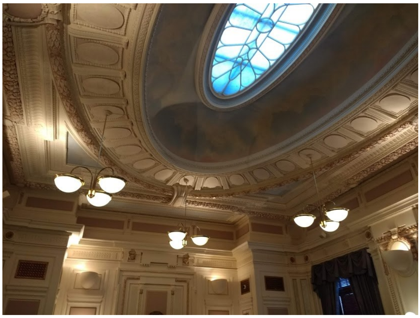
Ceiling of one of the ornate courtrooms