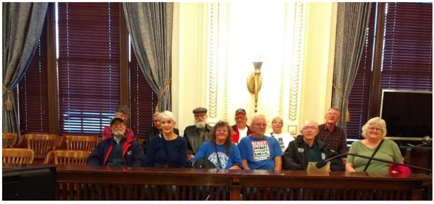
Group photo in the courtroom of the 12 members who attended the tour