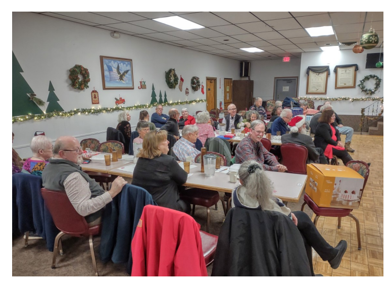
Enjoying a great dinner of prime rib or chicken cordon bleu, baked potato, green beans, salad, roll, and dessert.