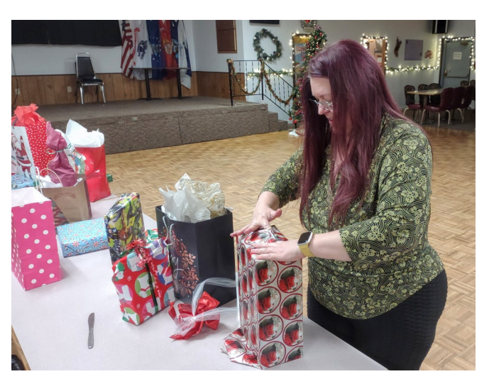
Opening the great variety of gifts.