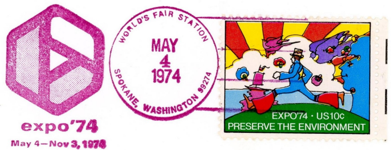
Figure 2: May 4, 1974 Expo '74 rubber-stamped opening day cancel with the stamp issued for the fair. Purple ink was used only on May 4, and black ink was used afterwards.